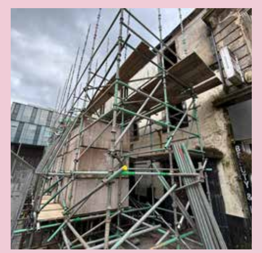
Temporary supports securing the historic facade