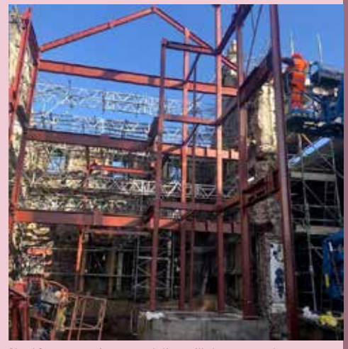
Steel frame nearing completion with temporary trusses showing/amongst